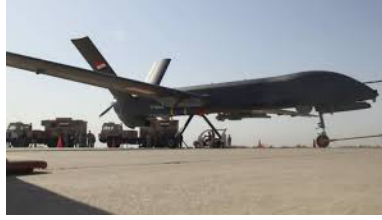
The CH-4 in Iraq

In the meantime, a range of UAVs has entered service throughout the PLA for a number of missions that enable and support military capabilities.