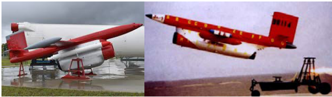
The La-17 and the CK-1 Launching

The PLA's history with the development and employment of unmanned systems dates back decades. China acquired its first UAV, the Lavochkin La-17, a basic radio-controlled target drone, from the Soviet Union in the 1950s. Initially, these 20 La-17s were primarily used by the PLA Air Force (PLAAF) as targets, such as for tests of and training with weapon systems. 5 After the Sino-Soviet split and subsequent withdrawal of Soviet Union military support in the early 1960s, the PLAAF decided to develop its own unmanned systems, since the initial La-17s were being rapidly used up without a viable replacement. 6 This motivated the development, starting in 1965, of the PLA's first notionally indigenous UAV, the Chang Kong - 1 ("Vast Sky," 长空一号, CK-1) UAV. The CK-1 was a radio-controlled target drone based on a reverse engineering of the La-17, which was initially developed by the Nanjing University of Aeronautics and Astronautics, under the oversight of the former Commission for Science, Technology and Industry for National Defense (COSTIND). 7 The introduction of the CK-1, which was first successfully tested around December 1966, 8 facilitated PLA testing and training, including for surface-to-air to missiles (SAMs), air-to-air missile targeting, and air defense force training. 9