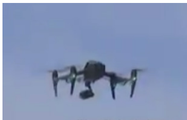
A Small SSF UAV

Countermeasures and Radar Department, which had previously acquired UAVs. 126 Not unlike the PLA's four services, the PLASSF will also leverage UAVs to provide reconnaissance capabilities in support of their missions. v For instance, in one training exercise, in which the PLASSF had to repair communications networks that had been damaged, UAVs were used to provide imagery in support of that activity. 127 Although the available information remains fairly limited, a video that was released regarding PLASSF training included a shot of a small four-rotor drone. 128