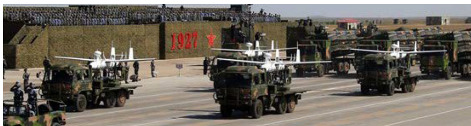
UAVs on Parade in August 2017

This parade displayed a number of ‘new-type’ UAVs for radar and communications interference, intended to disrupt adversary command information systems. 59 The PLAA UAVs participating in the parade came from a Central Theater Command Army Infantry Division’s Electronic Countermeasures Battalion. 60