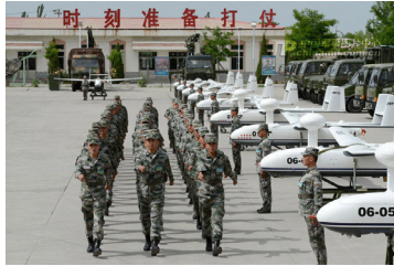
JWP-02 with Artillery Units

The PLARF appears to have fielded a number of UAVs across various units. The JWP-02 (ASN-207), which was delivered to artillery forces around 2013, has improved capabilities in tactical intelligence and reconnaissance, as well as artillery firing correction and damage assessment, 116 supporting the long-range precision firepower capabilities. 117, 118