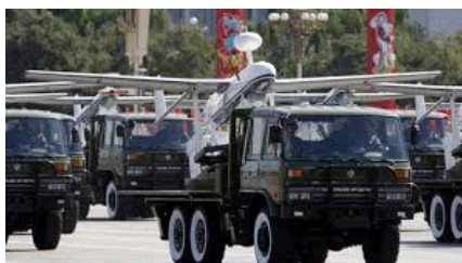
ASN-207 on Parade

The successor to that model, the ASN-207 (or JWP-02), j features an improved range, reportedly up to 600 kilometers, and overall greater performance. 57 Featured in China's 2009 National Day Parade, 58 it has likely also been adapted for several different variants. k The ASN-207 can be readily distinguished by its mushroom-shaped receiving antenna.