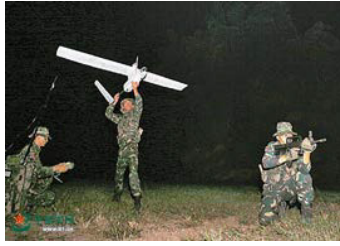
CH-802 with PLA Army Special Forces