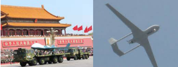
BZK-005 on parade and in flight