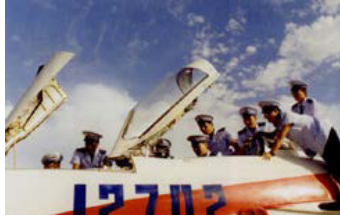
China's Supersonic Target Drone