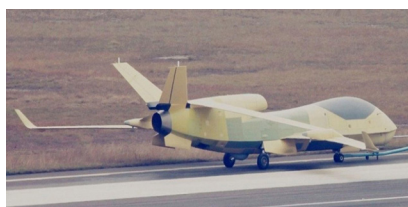
The ‘Soar Dragon’

As of early 2018, n the Xiang Long (“Soar Dragon,” 翔龙), which was initially seemingly designated the EA-03 but now apparently referred to as the WZ-9 (无侦-9), has also been fielded with the PLAN. 78 The Xiang Long is a high-altitude long endurance (HALE) UAV, with a range of 7,000 kilometers and maximum endurance of 10 hours, which was designed by AVICs Chengdu Aircraft Design and Research Institute and produced by AVIC’s Guizhou Aviation Aircraft Corporation. 79 So far, according to available reporting, the Soar Dragon has been tested in the Southern Theater Command Navy (former South Sea Fleet), 80 and it has been spotted at the Lingshui Naval Airbase on Hainan Island, where it could be used in support of airborne early warning. 81