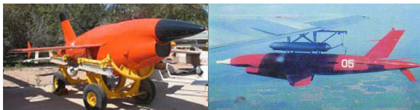
The AQM-34 and WZ-5

engineered to develop the Wu Zhen - 5 (无侦-5, WZ-5), created by Beihang University (the Beijing University of Aeronautics and Astronautics), which had entered service with the PLA by 1981, primarily for military reconnaissance. 14 Its export version was known as the Chang Hong - 1 (长虹-1号). In 1979, the WZ-5 was reportedly employed for reconnaissance in China's "self-defensive counter-strike" (自卫反击) against Vietnam. 15