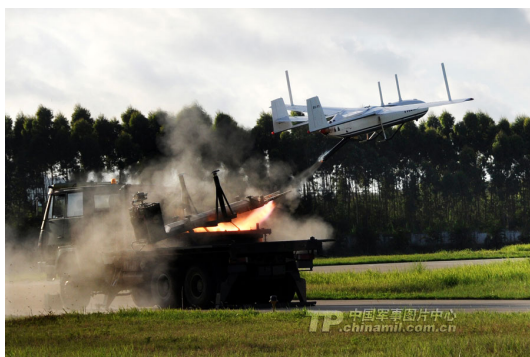
The ‘Silver Eagle’ Launching

The PLAN has also operated a medium-altitude, medium-endurance (MAME) UAV, a variant of the ASN-209 known as the “Silver Eagle,” (银鹰), fielded since at least 2011, which has been used for long-distance communications support and electromagnetic confrontation. 74 In a scenario in which satellite communications were compromised, the PLA might utilize UAVs to replace that capability, at least at a localized level. The PLAN might also use these UAVs, which have a range of 200 kilometers and maximum endurance of 10 hours, as guidance for targeting missiles. While PLAN UAVs may be especially prevalent in the Eastern Theater Command Navy, all three theater command navies appear to have fielded at least a limited number of UAVs. 75