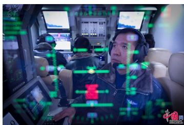
GJ-1 pilots in action

As 2011, the PLAAF's first UAV unit (95835 部队) was formally established under a command post in the Nanjing Military Region Air Force. o Next, in 2012, this unit was transferred to an aviation division in the former Jinan Military Region Air Force, and in 2014, it was again transferred to a base of the former Lanzhou Military Region Air Force. Subsequently, Unit 95835 was relocated to the Air Force Dingxin Test and Training Base in the Gobi Desert, and its location remains Bazhou, Xinjiang as of mid-2018. 95