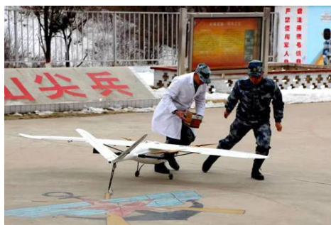
A Commercial UAV in Action

The PLA will likely use UAVs for logistics support, particularly for scenarios requiring rapid response, given their advantages of speed, accuracy, and flexibility. In some cases, the leveraging of commercial partnerships may be a major enabler. For instance, the PLAAF Logistics Department has developed a strategic cooperation agreement through which the commercial UAVs from SF Express and Jingdong were used for rapid delivery of medical supplies and equipment for rapid repairs in a trial exercise in January 2018. 45