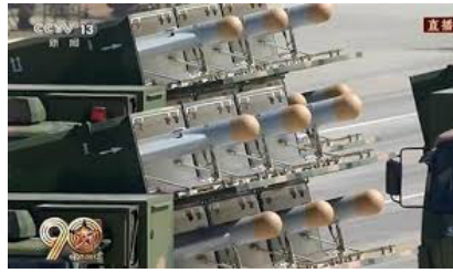
ASN-301 on parade

The PLAAF has also deployed the ‘Soar Dragon’ WZ-9 (无侦-9) to several locations as of early to mid-2017. 109 There were three WZ-9s spotted at the Western Theater Command’s Shigatse airfield in Tibet around August 2017, 110 around the time of the Sino-Indian border standoff that fall. 111 The WZ-9 has also been fielded in the Northern Theater Command, near the North Korean border, at Yishuntun airbase in Jilin Province. 112 The fact that its confirmed locations are strategic flashpoints seems unlikely to be a coincidence, perhaps indicating the value and operational capability of these units in providing strategic reconnaissance and intelligence for the PLA. †