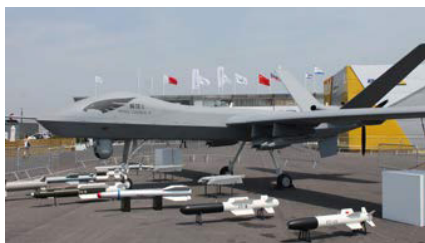
Wing Loong 2

Yilong -2 systems was introduced, which is larger in size, capable of faster speeds, and with greater maximum weight, roughly analogous to the U.S. Reaper. 101 As a likely successor to the Yilong-1 (GJ-1), it might also enter service with the PLAAF as the GJ-2. q